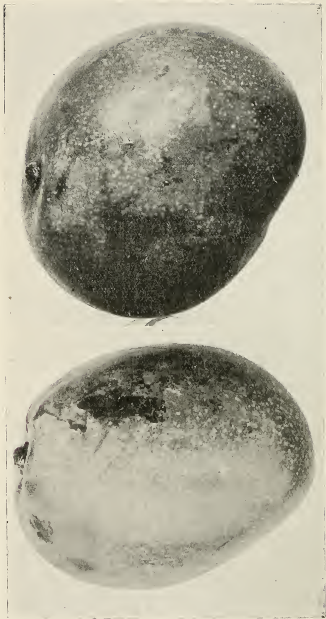
(Left) MANGA AMARILLA, FROM HABANA, SHOWING CHARACTERISTIC FORM OF THIS TYPE.